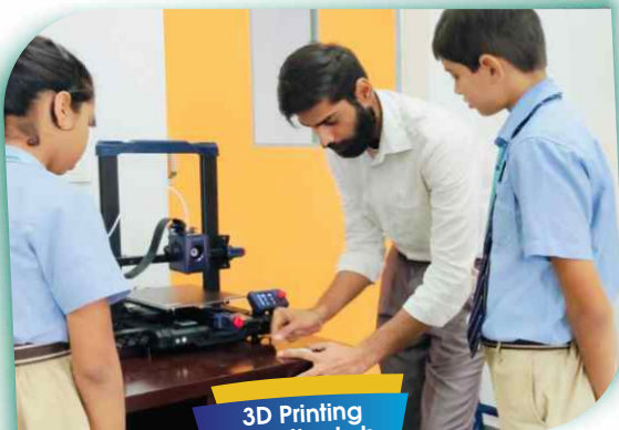
3D Printing Robotics Lab