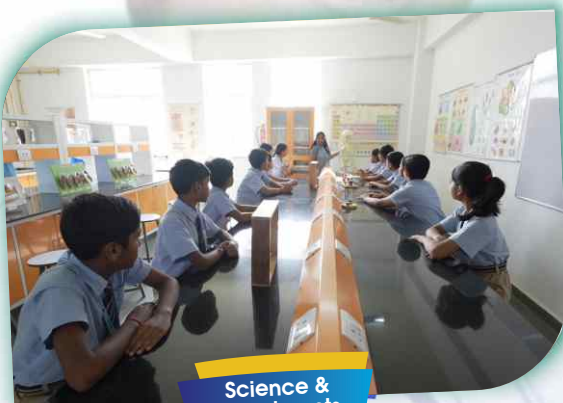
Science & Experiments