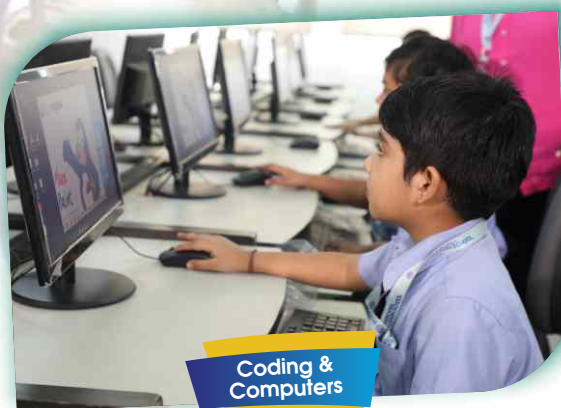
Coding & Computers