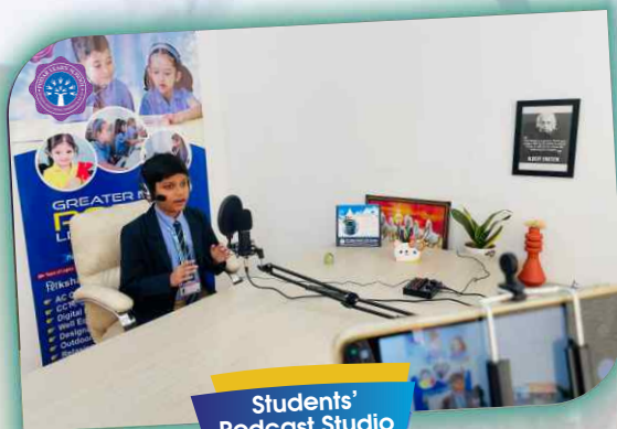
Students' Podcast Studio