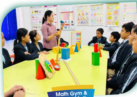
Math Gym & Mental Math