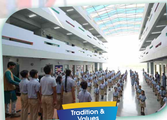
Tradition & Values